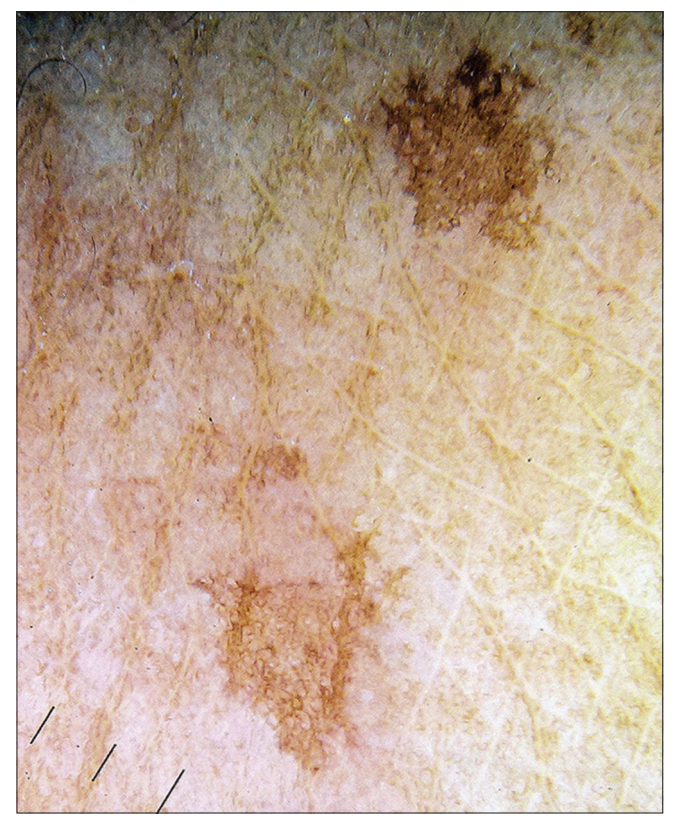
Figure 2: Dermoscopic examination under non-polarized light showing an accentuated brown-coloured regular pseudoreticular pigment network

Partial unilateral lentiginosis is an unusual pigmentary disorder characterized by multiple lentigines clustered over a localized area with a sharp midline demarcation, usually confined to one or more dermatomes. The onset is usually in childhood, and any body site can be affected. When on the face, partial unilateral lentiginosis can be mistaken for nevus of Ota, especially if ocular pigmentation is present, like in our patient. Interestingly, ocular pigmentation has been reported in a few patients with partial unilateral lentiginosis as well. <sup>1-3</sup> However, unlike the mottled blue-gray pigmentation in nevus of Ota, the pigmentation in partial unilateral lentiginosis is brown-colored,