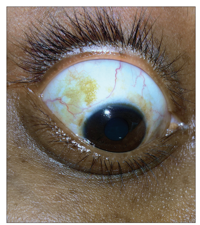
Figure 1b: Brownish pigmentation on the ipsilateral bulbar conjunctiva

nerve on the right-side of the face with a sharp midline demarcation [Figure 1a]. There was no background pigmentation suggestive of a café-au-lait- macule. Eye examination revealed brown-colored macules on the bulbar conjunctiva of the right eye [Figure 1b]. Conjunctiva on the left side, oral, and nasal mucosa were not affected. Dermoscopic examination of the pigmented macule under nonpolarized as well as polarized light (x10 magnification) showed an accentuated, regular, brown-colored pigment network [Figure 2]. With the provisional clinical diagnosis of nevus of Ota and segmental lentiginosis, a skin biopsy from one of the pigmented macules was planned. During