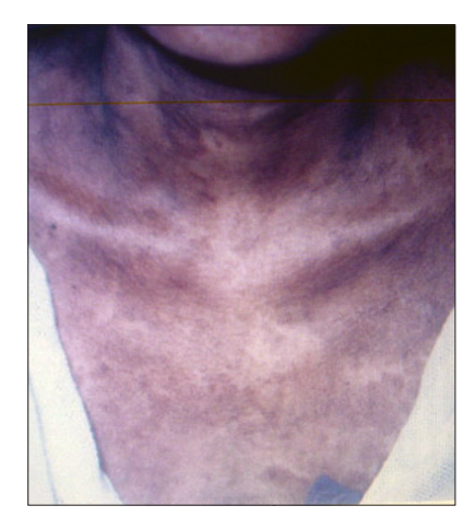
Figure 4: Improvement of skin lesions after surgery

may be seen in the advancing margins or at the centre of the lesions that subsequently erode, become crusted and heal with hyperpigmentation. The lesions occur most commonly on the perineum, distal extremities, lower abdomen and face. [1,2] NME usually appears as a paraneoplastic process in patients with glucagonoma. [2] In 1974, Mallinson et al , defined the glucagonoma syndrome as necrolytic migratory erythema with glucagonoma, diabetes mellitus, anemia and weight loss.