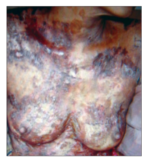
Figure 1: Erythematous scaly annular and serpiginous plaques with areas of erosions and pigmentation on the trunk

A 52 year-old woman presented with a two-year history of pruritic, burning and expanding red rings involving the entire body. She had marked fatigue, anorexia and weight loss. Examination revealed a cachectic woman with symmetrical erythematous annular and scaly patches involving the trunk [Figure 1], lower limbs and back. A few pustules and vesicles were present on the trunk. Intertriginous areas showed erosions. Glossitis and stomatitis were also present.