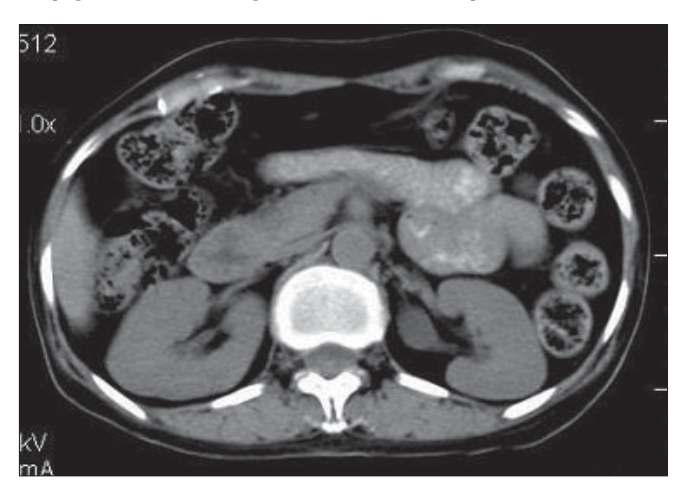
Figure 3: CT scan of the abdomen showing a well-enhanced, soft tissue lesion 56 x 40 x 30 mm in size with a speck of calcification in the tail of the pancreas

Necrolytic migratory erythema (NME) is a rare skin condition characteristically present as irregular annular eruptions with serpiginous advancing borders. Vesicles, pustules or bullae