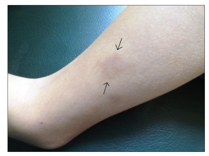
Figure 1: Well-defined ecchymotic patch on the lower leg