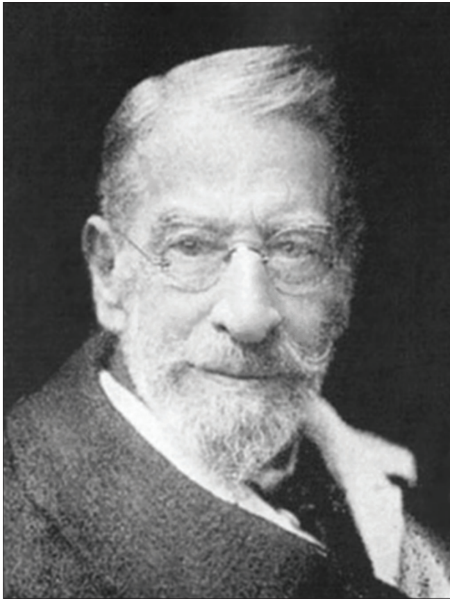
Figure 1: Jean Ferdinand Darier (1856–1938)

the epidermis. However, its diagnostic importance was not realized under decades later. Following this, although the importance of this finding was later understood, the feature was given an erroneous eponym, quite simply 'by mistake', one that has perpetuated till date.