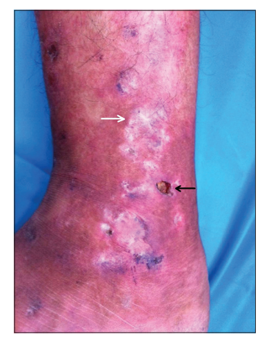
Figure 2: Livedoid vasculopathy. Note the erythema, edema, ulcer (black arrow) and the characteristic ivory-white stellate scars (white arrow)

vasculopathy. Hairston et al. used enoxaparin in a dose of 1 mg/kg twice daily (the dose used to treat active thrombosis) for 6 months followed by 1 mg/kg/day in one patient and 30 mg/day twice daily (peri-operative thrombo-prophylactic dose) in the other for 7 months. Di Giacomo et al. used enoxaparin 40 mg daily, dalteparin 5000 IU/day and unfractionated heparin 5000 IU 12th hourly in 5, 3 and 3 patients respectively.[5] Yang et al. treated 27 patients of atrophie blanche using unfractionated heparin. Nineteen (70%) of these patients who were administered a dose of 5000 IU daily had significant pain relief.[14] Hesse and Kutzner employed sub-thrombo-prophylactic doses of dalteparin (2500 IU/day for 14 days and then on alternate days until the ulcers healed) in 16 patients, nadroparin (2850 IU, 0.3 ml) in four patients and enoxaparin in two patients for an average duration of 7 weeks. Nineteen (86%) of these 22 patients showed complete remission.[7]