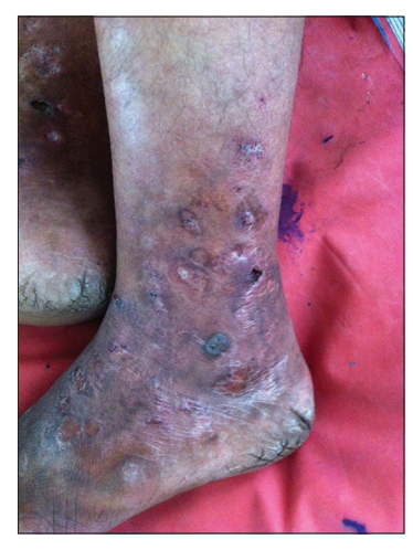
Figure 3: Same patient [Figure 2] after 1 week of treatment with subcutaneous enoxaparin 75 mg twice daily. Note the reduction in erythema and edema, and the beginning of resolution

vasculopathy. Hairston et al. used enoxaparin in a dose of 1 mg/kg twice daily (the dose used to treat active thrombosis) for 6 months followed by 1 mg/kg/day in one patient and 30 mg/day twice daily (peri-operative thrombo-prophylactic dose) in the other for 7 months. Di Giacomo et al. used enoxaparin 40 mg daily, dalteparin 5000 IU/day and unfractionated heparin 5000 IU 12th hourly in 5, 3 and 3 patients respectively.[5] Yang et al. treated 27 patients of atrophie blanche using unfractionated heparin. Nineteen (70%) of these patients who were administered a dose of 5000 IU daily had significant pain relief.[14] Hesse and Kutzner employed sub-thrombo-prophylactic doses of dalteparin (2500 IU/day for 14 days and then on alternate days until the ulcers healed) in 16 patients, nadroparin (2850 IU, 0.3 ml) in four patients and enoxaparin in two patients for an average duration of 7 weeks. Nineteen (86%) of these 22 patients showed complete remission.[7]