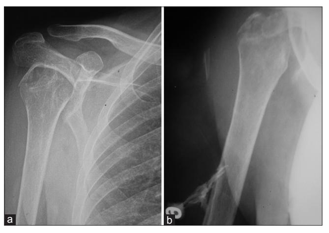
Figure 2: (a) X-ray PA view of the right shoulder showing a lytic lesion in the head of humerus, (b) Sinogram delineating the communicating path between the sinus and the underlying bone

Histopathological examination from the lesion hypopigmented below the discharging sinus revealed an epithelioid cell granuloma with lymphocytic infiltrate [Figure 3a]. Fite Faraco stain did not show acid-fast bacilli. Histopathological evaluation from the wall of the sinus tract revealed a granuloma in the mid-dermis composed of epithelioid giant cells, lymphocytes and plasma cells with evidence of suppuration [Figure 3b]. However, tissue polymerase chain reaction and culture for Mycobacterium tuberculosis were negative. Bone biopsy from the lytic