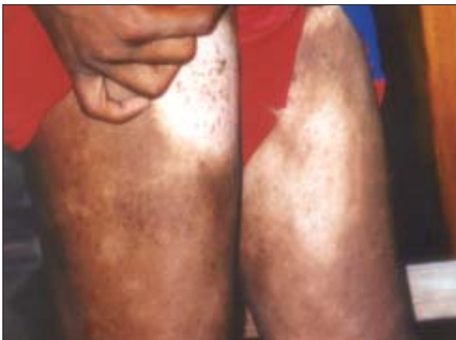
Figure 2: Depigmented and poikilodermic patches of over thigh

Histological examination of a vitiligo-like lesion on the abdomen showed an infiltrate of mononuclear cells at the interface with prominent epidermotropism, with lymphocytes cells lying singly as well as in groups (Figure 3). No atypical cells were seen. Hemogram, routine blood biochemistry, chest X-ray and urine analysis were normal. There were no atypical cells in the peripheral blood.