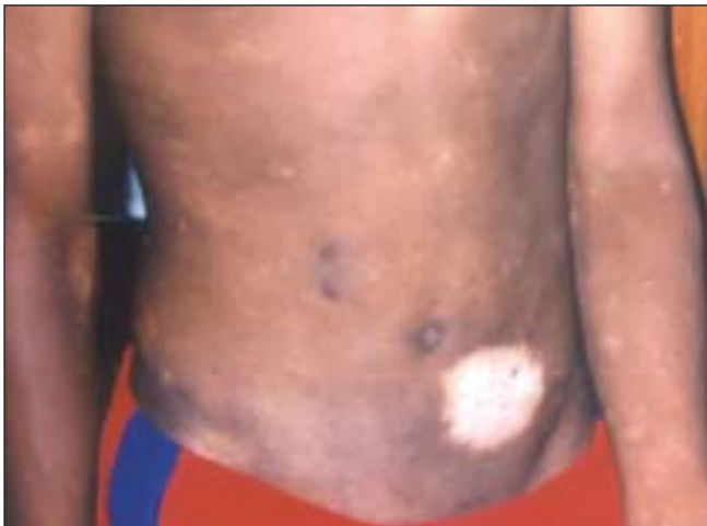
Figure 1: Hypopigmented and depigmented lesions over trunk

On examination, there were many asymptomatic hypopigmented and a few vitiligo-like, depigmented oval and irregular, well-defined, atrophic patches 8 to 15 cm in diameter on the trunk and extremities. The patches showed a finely wrinkled slightly scaly surface. They were not indurated and there were no telangiectases. The vitiligo-like lesions were on the abdomen, right axilla and both thighs (Figures 1 and 2). The largest such lesion was about 15 cm along the long axis. No lymphadenopathy was noted. General examination was unremarkable.