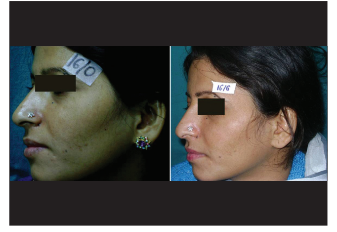
Figure 3: Pre- (MASI=7.2) and post-treatment (MASI=2.4) clinical photograph after six sessions of glycolic acid peel in melasma