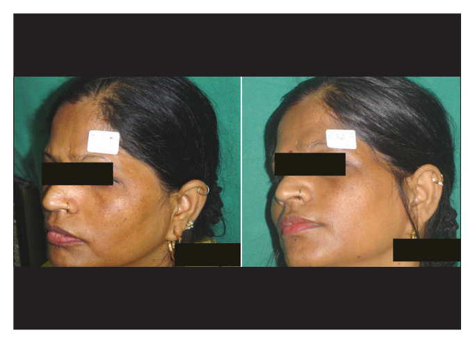
Figure 2: Pre- (MASI=9) and post-treatment (MASI=2.4) clinical photograph after 12 sessions of low fluence QSNYL in melasma

hyper pigmentation. Overall, fewer side effects were observed after low-fluence QSNYL treatment compared to high-fluence QSNYL.