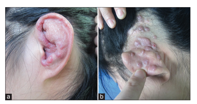
Figure 1: (a and b) Grouped plaques and nodules involving the skin of the left ear, posterior auricular area and adjacent scalp

We report a 30-year-old woman who presented with a three-year history of itchy and tender lesions over the left ear, mastoid region and adjacent scalp. These were increasing in size. Cutaneous examination revealed bright red, eruptive papules and nodules ranging in size from 0.5 cm to 1 cm in diameter [Figure 1a and b]. Examination showed no regional lymphadenopathy or any other abnormalities. The routine blood chemistry and urine analysis were within normal limits. The absolute eosinophil count and immunoglobulin E levels were normal. Histopathological examination of a nodule revealed mild epidermal hyperplasia and proliferation of small blood vessels lined by large