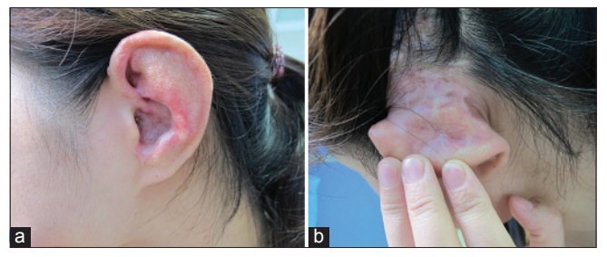
Figure 4: (a and b) Appearance of the lesions at nine months follow-up