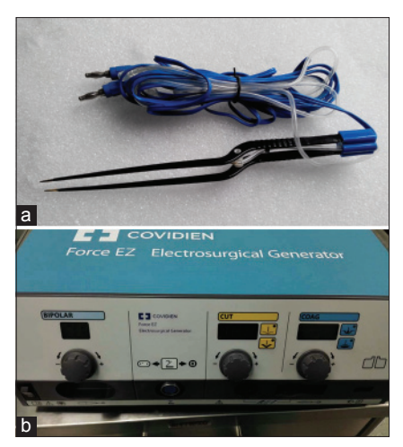
Figure 3: (a) The bipolar coagulation forceps. (b) The electrosurgical generator to which bipolar coagulation forceps was connected

shows T-cell lymphoid aggregates with well-formed B-cell germinal foci. However, in angiolymphoid hyperplasia with eosinophilia, there is nodular and diffuse T cell infiltration with small clusters of B-cells. Additionally, Kimura's disease can be differentiated from angiolymphoid hyperplasia by the presence of vascular proliferation and the endothelial cells usually being flat.