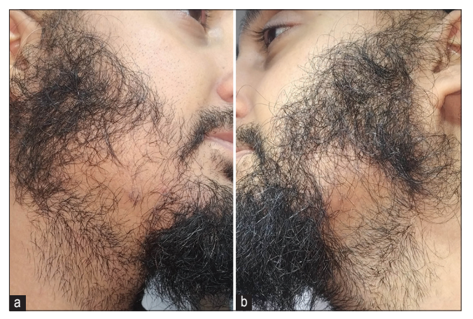
Figure 1a and b: Bilateral patches of traction alopecia before surgery

A 30-year-old man, of Sikh faith, presented with asymptomatic patchy hair loss on both sides of the mandibular area. The alopecia was more extensive on the right side and extended up to the cheek and upper part of the neck. The exact duration was not known and this underwent an insidious evolution to the present size over the past many years. On examination, an irregular patch of alopecia measuring 5 \times 4 cm was seen on bilateral mandibular area and also extending to the cheek and upper part of the neck [Figures 1a and b]. Within the alopecia patch, we observed thin, vellus-like hairs centrally and midlength thicker hairs (broken terminal hairs) at the borders on