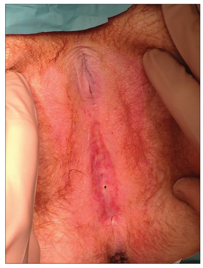
Figure 1: The patient at presentation: Complete fusion of the labia minora along the midline with total obliteration of vaginal introitus, with associated burial of clitoris. Urethral meatus was hidden. A pinhole opening at the midline permitted a dripping outflow of urine and menstrual blood

A medical history of persistent severe vulvar itching and soreness as well as the morphological appeareance of the vulvar and perineal area suggested the diagnosis of inveterate vulvar lichen sclerosus. The affected skin was pale, thinned, and wrinkled. Inveterate disease had determined scarring of tissue, with complete obliteration of vaginal introitus. A vulvar biopsy confirmed the clinical suspicion of lichen sclerosus [Figure 2]. Pelvic ultrasound image showed a 2.5-cm submucous uterine leiomyoma.