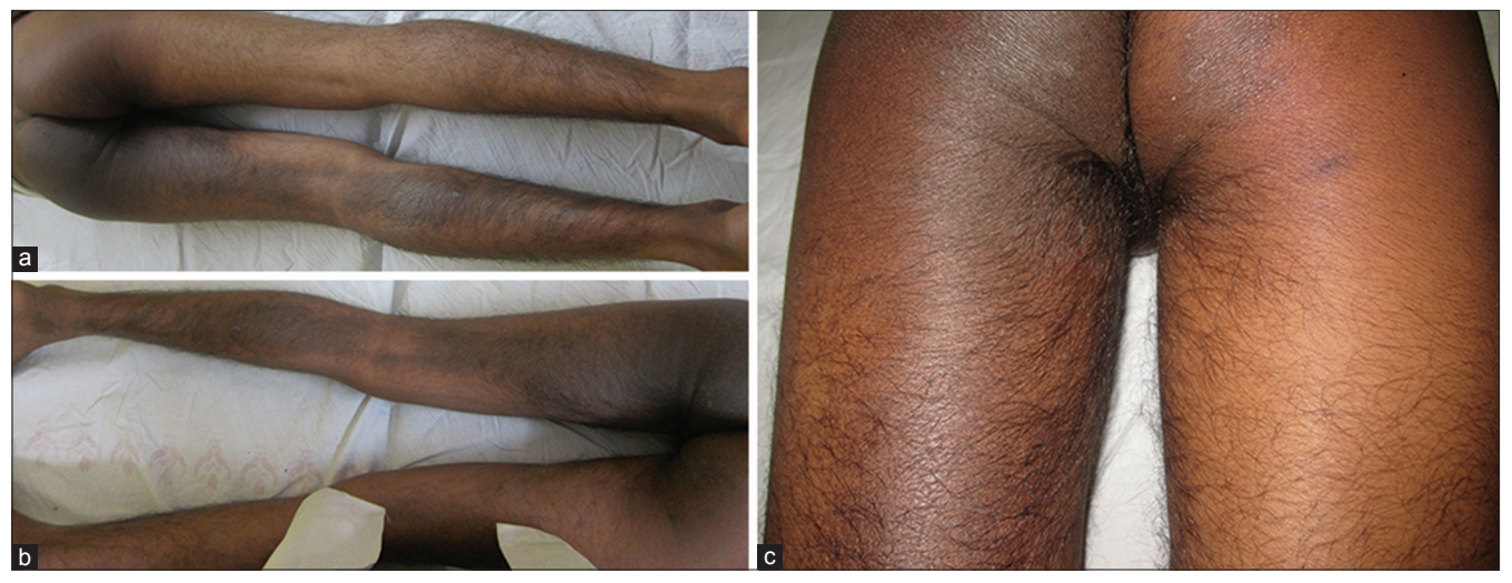
Figure 1: (a) Linear hyperpigmented macules with hypertrichosis on left leg extending from buttock till ankle joint; (b) linear hyperpigmented macules with hypertrichosis on left leg extending from buttock till ankle joint; (c) hyperpigmented macules with hypertrichosis on left thigh in comparison to right thigh

Although in its classic form, it is considered to be an acquired disorder, congenital<sup>[1]</sup> and late onset<sup>[2]</sup> Becker's nevus lesions have also been reported. The lesions may have various shapes but classically have a geographic or block-like configuration in an irregular fashion; however, a blaschkoid pattern or linear pattern has been reported in the literature in a few congenital cases.[1,3] This abnormal phenotypic expression may be due to the somatic mutation occurring only in the affected segment of the body leading to linear pattern along with block configuration of some dermatoses. Blaschko's lines represent a pattern assumed by many different nevoid and acquired skin diseases on skin and mucosa.[4] The question of whether Becker's nevus follows Blaschko's lines or not remains controversial. Although in 1976, Jackson listed Becker's nevus as one of the nevoid skin diseases that follows Blaschko's lines,[5] this fact was contradicted by Bolognia et al.,