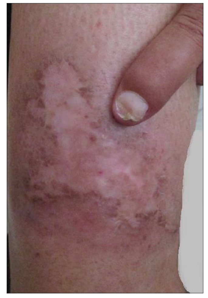
Figure 4: Favorable outcome of both lesions of leg and index finger after treatment

The authors certify that they have obtained all appropriate patient consent forms. In the form, the patient has given her consent for her images and other clinical information to be reported in the journal. The patient understands that name and initials will not be published and due efforts will be made to conceal the identity, but anonymity cannot be guaranteed.