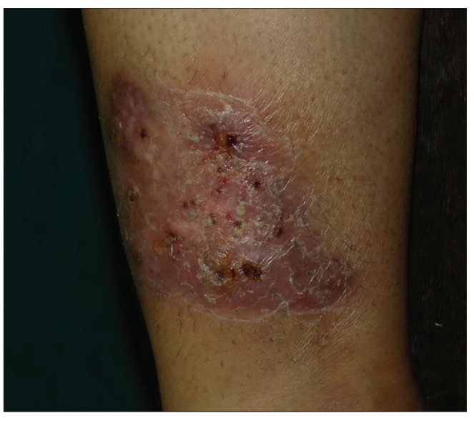
Figure 2: Erythematous plaque with several pustules on the left lower leg