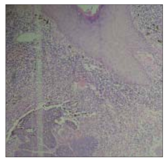
Figure 2: Saw toothing of rete ridges with lichenoid infiltrate in the upper dermis; dense mononuclear infiltrate in the upper dermis impinging on the dermo-epidermal interface; basal cell degeneration; melanin deposition; lobules of basaloid cells visible in the left lower quadrant (H&E, x100)

Role of LP in the tumorigenesis could have some interesting connotations. It is known that susceptibility to UVB-induced inhibition of contact hypersensitivity is a better indicator of BCC risk than cumulative sun exposure, suggesting an important role for immune surveillance in protecting against development of cancer.<sup>[4]</sup> LP, being a chronic inflammatory autoimmune disease that produces basal cell damage, could result in a cytokine milieu that disturbs this surveillance mechanism.