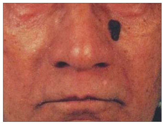
Figure 1: Darkly pigmented, sharply marginated, indurated paranasal plaque