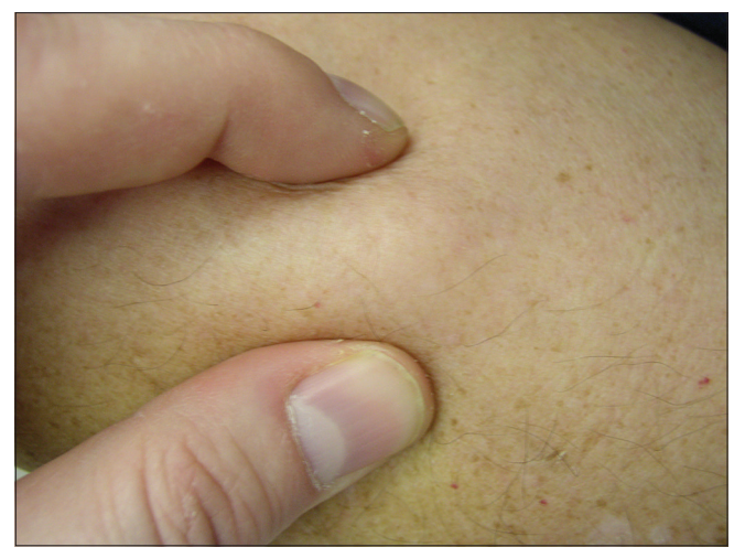
Figure 1: Palpable, relatively well-demarcated and slightly prominent lipomalike lesion in the medial part of left crura

The authors certify that they have obtained all appropriate patient consent forms. In the form the patient has given