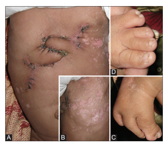
Figure 1: Images of the first patient showing: (A) large area of abdominal wall dehiscence that has been operated; (B) many hypopigmented atrophic plaques along Blaschko's lines on the lateral abdominal wall; (C) lobster claw deformity in the right foot; (D) syndactyly in the right foot

Focal dermal hypoplasia (FDH), Goltz syndrome, or Goltz–Gorlin syndrome (OMIM #305600) is a rare X-linked dominant disease. Mutation in the PORCN gene(Xp11.23) causes defective Wnt signaling and results