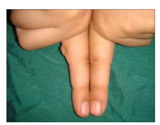
Figure 3: Nine months after surgery, no recurrence had been identified in left second finger