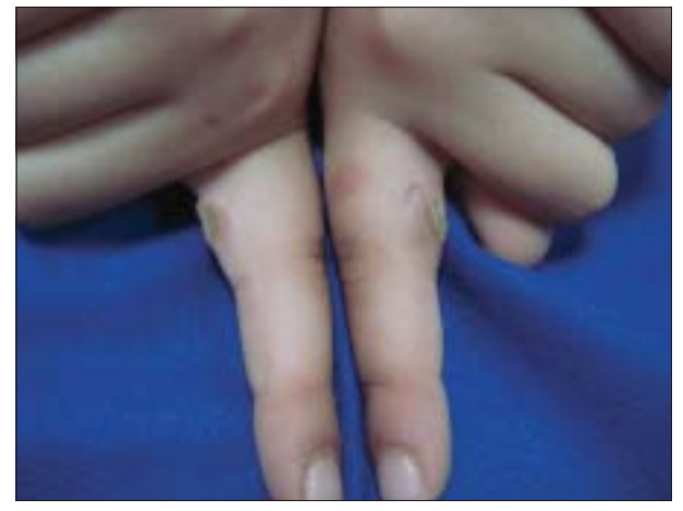
Figure 1: Preoperative view of the fingers with small keratotic projection at the medial aspect of the second finger

An 8-year-old girl presented with a painless hard keratotic projection on the medial aspect of the first phalanx on her bilateral second fingers, 8 mm wide and 4 mm long. On the hyperkeratotic surface, skin marking was distinguishable [Figure 1]. The projection had been present since birth but her family history was not contributory. The patient sometimes used to cut this nail but it again regrows. Neither active nor passive motions at any joint of those fingers were restricted. There were no other congenital abnormalities. X-rays of hands revealed no bone deformity on the first phalanx of the affected fingers [Figure 2]. We