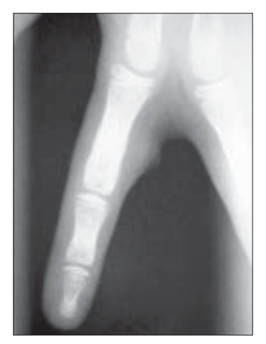
Figure 2: Radiography disclosed a small ectopic nail having no contact with affected finger periosteum

Ectopic nail is an extremely rare condition related to acquired or congenital anomalies.<sup>[1,3]</sup> Almost 40 cases have been reported in the literature;<sup>[3]</sup> 24 of them have been reported in Japan. As there is no logical epidemiologic explanation why most cases would occur in Japan, ectopic nail might be regarded as an unremarkable anomaly in other countries.<sup>[2]</sup> Recently Tomita et al. have hypothesized that double finger nail and ectopic nail would have different appearances derived from the same embryologic pathogenesis;<sup>[5]</sup> however, the difference in clinical characteristics between these two nail anomalies is quite apparent such as disturbance of the interphalangeal joint motion in double finger nail and no disturbance of