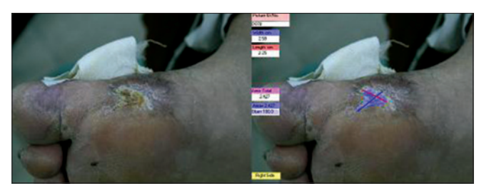
Figure 3: The ulcer after 4 months fibroblast application

showed signs of re-epithelization and at 4 months the ulcer was completely healed. Dressing was continued using regular sterile gauze dressing. The patient continued his normal activity during this period. This accelerated healing might have contributed to reducing complications such as infection, achieving a better outcome and also to potentially reducing the total cost of treatment for the patient.