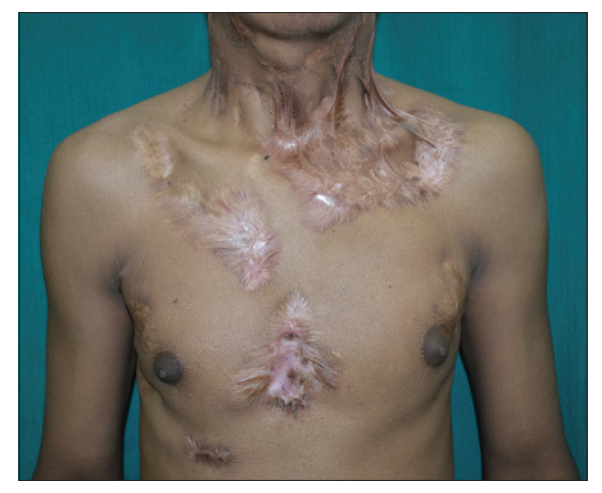
Figure 4: Resolution of lesions with scarring following treatment

Co-existence of different types of cutaneous tuberculosis has been described; various authors have reported scrofuloderma with tuberculosis verrucosa cutis, lupus vulgaris with tuberculosis verrucosa cutis, papulonecrotic tuberculid with lichen scrofulosorum and lupus vulgaris with papulonecrotic tuberculid, with the time gap between the development of the forms ranging from simultaneous to 3 months and even 5 years.<sup>[2]</sup> Interestingly, this patient also developed papulonecrotic tuberculid in addition to scrofuloderma and multifocal tuberculous gummas.