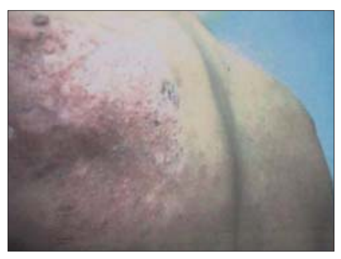
Figure 1:A large circumscribed irregularly surfaced soft plaque over shoulder