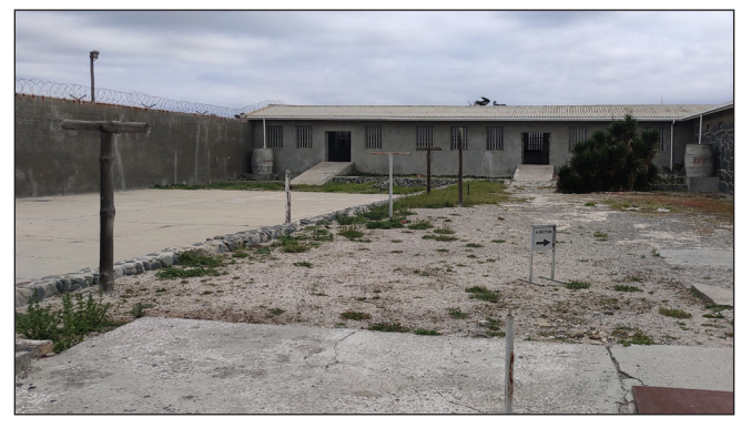
Figure 3: Common ground in between the isolation chambers with a high brick wall secured by barbed fenced wires.

The closure of the leprosy colony on Robben Island in 1931 signifies a pivotal moment in the medical landscape of leprosy. This marked a global shift in perceptions, advocating for improved medical care and the integration of individuals into society over isolation. Robben Island's transition serves as a powerful reminder of the broader progress in dismantling the stigma associated with leprosy, emphasising a compassionate and medically informed approach.<sup>4</sup>