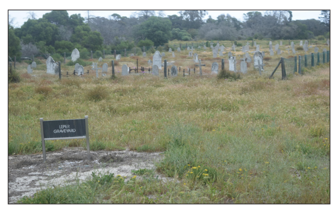
Figure 4: The remains of 'Leper Graveyard', with hundreds of named and