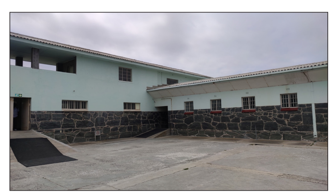
Figure 2: Isolation chambers in the Robben Island compound for both the apartheid political prisoners as well as the leprosy patients.

The historical context sheds light on how limited medical knowledge and prevailing misconceptions perpetuated fear, discrimination, and immense suffering for those afflicted. The leprosarium cemetery came into existence during the infirmary period, the remains of which can still be seen [Figure 4].