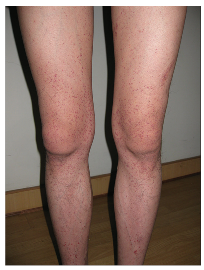
Figure 1: Typical palpable purpura on the legs of a patient with Henoch-Schonlein purpura

There were 57 patients diagnosed with Henoch-Schonlein purpura recruited for the study. Among them, 31 patients were female and the remaining 26 patients were male. On average, the age of the Henoch–Schonlein purpura patients was 49 \pm 22 years. They were divided into two groups. Group 1 included the patients who showed only cutaneous symptoms, while group 2 consisted of the patients with GI and/or renal manifestations, in addition to