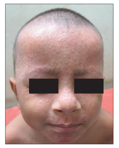
Figure 1: Multiple erythematous scaly papules over the face