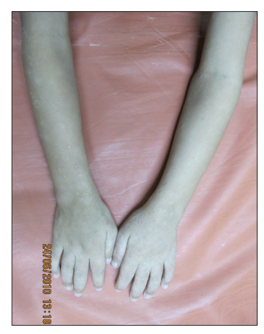
Figure 2: Multiple erythematous scaly papules over bilateral upper extremities

are known to initiate and exacerbate the condition and should be avoided.[1,4]