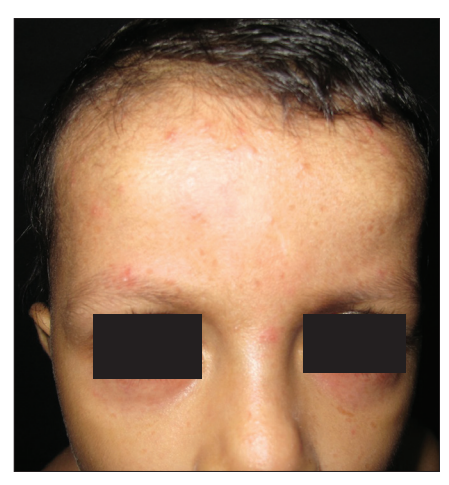
Figure 5: Lesions subsided with small atrophic pigmented scars over face

are known to initiate and exacerbate the condition and should be avoided.[1,4]