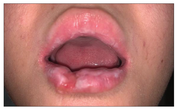
Figure 3: Post-treatment image

microneedles enabled disease regression and ulcer resolution. Topical application of microneedles is safe (compared to systemic steroids) and can be applied daily by patients themselves. Such a therapy may be considered as an early treatment option for patients with complex aphthous ulcers.