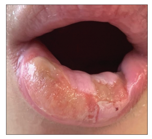
Figure 1b: Multiple lower lip ulcers, coalescing in some areas, with active raised borders

Recurrent aphthous stomatitis is a clinical diagnosis made after thorough clinical exclude assessment and investigations [Table 1] have been used to exclude underlying systemic causes.6 It can be divided into mild or severe disease known as simple and complex aphthosis, respectively. Simple aphthosis is common, with small and few episodic ulcers healing quickly with minimal pain and disability. Complex aphthosis is uncommon and can be episodic or continuous, with large slowhealing ulcers associated with marked pain and disability. The patient was diagnosed with primary idiopathic major complex recurrent aphthous ulcers, which is a diagnosis of exclusion. The pathogenesis is poorly defined, with predisposing factors including genetic, haematological, vitamin deficiencies, oral trauma, smoking and stress.<sup>6</sup> In our patient, an element of oral trauma in the form of self-biting contributed to the worsening of her oral ulcers. While hitherto there were no associated genital ulcers, eye complaints, papulopustular skin lesions or pathergy that fulfilled the diagnostic criteria of Behcet disease, complex aphthosis could be a forme fruste of the disease and our patient will be followed up over time.7 Inflammatory bowel disease was