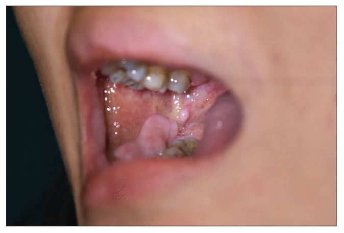
Figure 1a: Extensive erosions over bilateral buccal mucosa