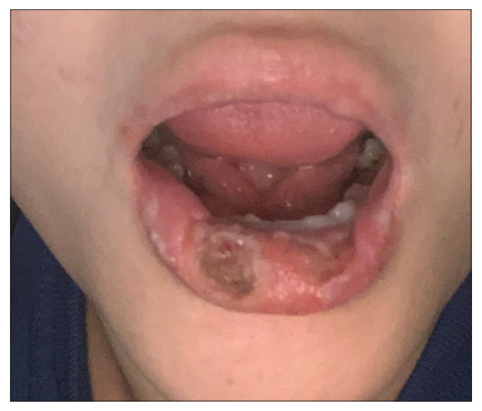
Figure 1c: Persistent recurring lower lip ulcers coalescing in some areas

Recurrent aphthous stomatitis is a clinical diagnosis made after thorough clinical exclude assessment and investigations [Table 1] have been used to exclude underlying systemic causes.6 It can be divided into mild or severe disease known as simple and complex aphthosis, respectively. Simple aphthosis is common, with small and few episodic ulcers healing quickly with minimal pain and disability. Complex aphthosis is uncommon and can be episodic or continuous, with large slowhealing ulcers associated with marked pain and disability. The patient was diagnosed with primary idiopathic major complex recurrent aphthous ulcers, which is a diagnosis of exclusion. The pathogenesis is poorly defined, with predisposing factors including genetic, haematological, vitamin deficiencies, oral trauma, smoking and stress.<sup>6</sup> In our patient, an element of oral trauma in the form of self-biting contributed to the worsening of her oral ulcers. While hitherto there were no associated genital ulcers, eye complaints, papulopustular skin lesions or pathergy that fulfilled the diagnostic criteria of Behcet disease, complex aphthosis could be a forme fruste of the disease and our patient will be followed up over time.7 Inflammatory bowel disease was