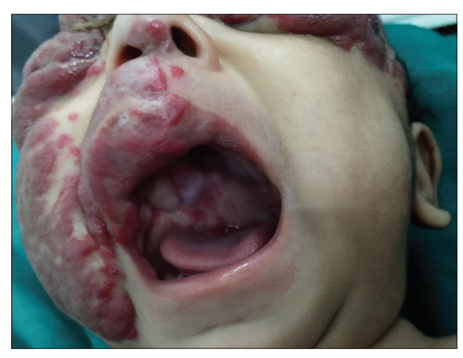
Figure 3: Hemangioma present over the right hard palate