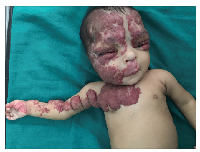
Figure 2: Hemangioma involving bilateral upper face including peri-orbital regions, right cheek, philtrum of nose, right chest, arm and hand