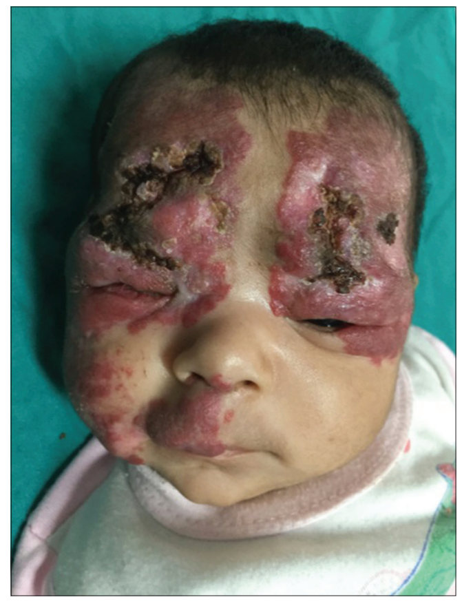
Figure 1: Hemangioma involving upper face including peri-orbital regions, cheek, forehead, frontal and right temporal scalp and philtrum of nose. Note the ulceration and hemorrhagic crusting and discharge from the eyes

We initiated oral prednisolone (3.3 mg/kg), along with systemic and topical antibiotics including tobramycin eye drops. The crusted lesions healed within a week with resolution of the discharge and redness of the eyes. After 15 days, topical timolol (drops 0.5%), 1 drop per cm<sup>2</sup> (4 drops per lesion) twice daily, without occlusion, was added for the non-ulcerated hemangioma over the trunk. The patient's mother was counselled regarding the possible side-effects