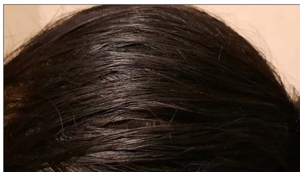
Figure 1a: Normal scalp image—grey hair not visualised clearly

We have observed that the same principle can be applied to hair devoid of melanin. Under Wood’s lamp, grey hair (partial, complete and even coloured) stand out compared to normally pigmented hair [Figures 1a and 1b]. This phenomenon can be used in the evaluation of conditions like premature canities and also possibly to assess the regrowth in alopecia areata (where the new hair tend to be lighter in colour). The main limitation is that this does not work well