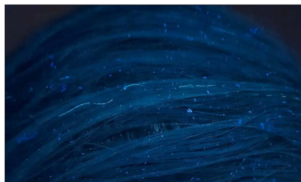
Figure 1b: Demonstration of clearer visualisation of grey hair under Wood’s lamp (same patient as in Figure 1a)