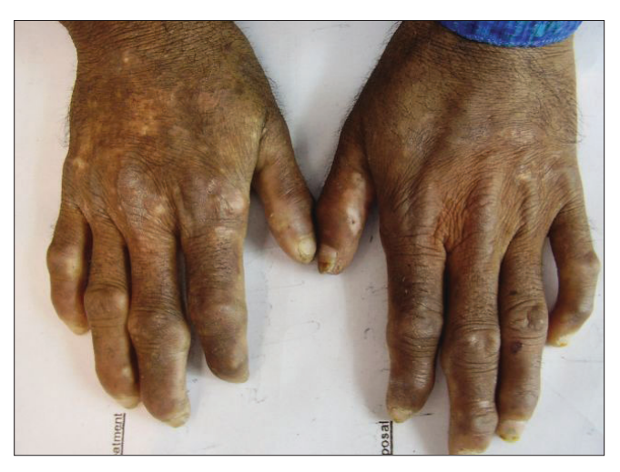
Figure 2: Short stubby hands with hypertrichosis and scarring

CEP is a rare subtype of porphyria that causes the skin to be overtly sensitive to sunlight. Underlying defect is mutations of two alleles for the gene encoding the enzyme