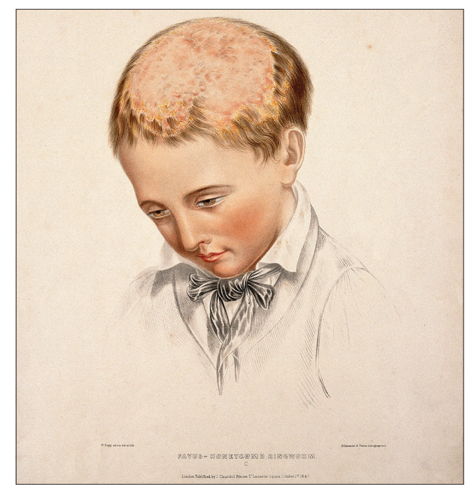
Figure 2: "A boy with a skin disease of the scalp. By W. Bagg, 1847."