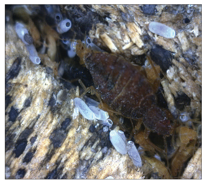
Figure 2b: Ex vivo dermoscopy of wooden crevices showing multiple bed bugs and their empty eggs (×200; Polarizing; Dino-Lite AM413ZT). Note that an empty egg appears white and translucent, while a viable egg is more opaque and has an red eye