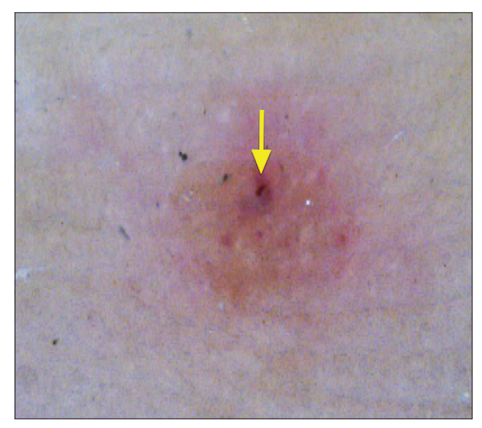
Figure 2a: Polarizing dermoscopy showing diffuse erythema with a central hemorrhagic punctum. (×50; Polarizing; Dino-Lite AM413ZT)

An old destitute man, brought on a wheel chair, presented with multiple red itchy lesions all over the body for the past 3 months. On examination, multiple erythematous papules with and without excoriations were present all over the body, predominantly involving the trunk [Figure 1]. Palms, soles and mucosae were spared. Dermoscopy of the cutaneous lesions revealed presence of a diffuse erythema with a central hemorrhagic punctum [Figure 2a]. Ex-vivo dermoscopy of the wooden handle of the wheel chair revealed a number of bed bugs and their eggs hiding among the wooden crevices [Figure 2b and c].