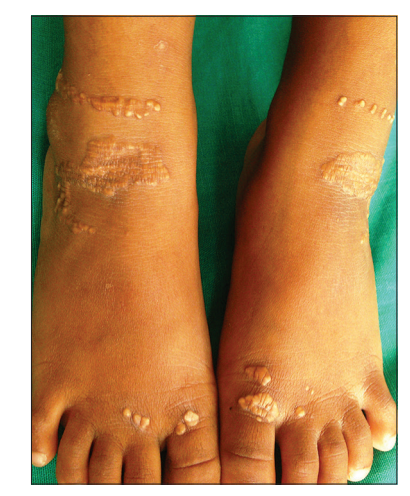
Figure 1: Yellowish flat topped plaques over the ankle and first metatarsophalangeal joint

homozygous(typeIIa)familialhypercholesterolemia).<sup>[2]</sup> A similar finding was seen in our case. In addition, lesions were also seen in areas of trauma (Koebner's