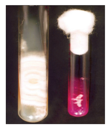
Figure 4: Fluffy white growth of Trichophyton mentagrophytes in SDA. (Left) Positive urease test (Right)