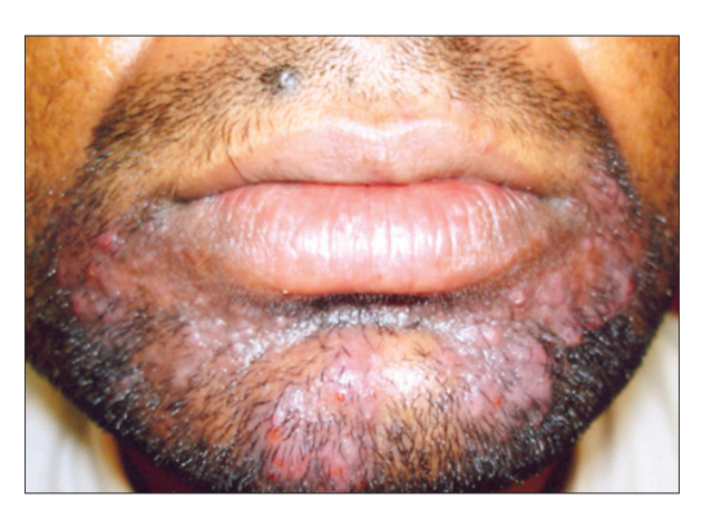
Figure 1: Inflammatory nodules and plaques with superficial crusting and oozing on beard region

A 31-year-old male schoolteacher presented with mildly pruritic erythematous crusted plaques and nodules studded with pustules on chin and left malar region of 20 days duration [Figures 1-2]. He complained of increased itching and burning sensation after application of soap, aftershave lotion and perfume. He was not using any other cosmetic. He had no previous history of atopy, drug allergy, photosensitivity or any systemic complaints. He occasionally visited the barber's shop for shaving his beard. There were no pets at home.