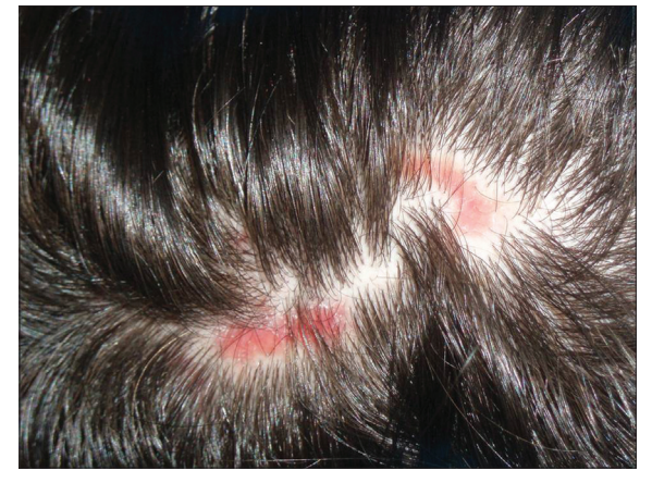
Figure 3: Erythematous linear plaques with alopecia on the scalp of the second patient in the study