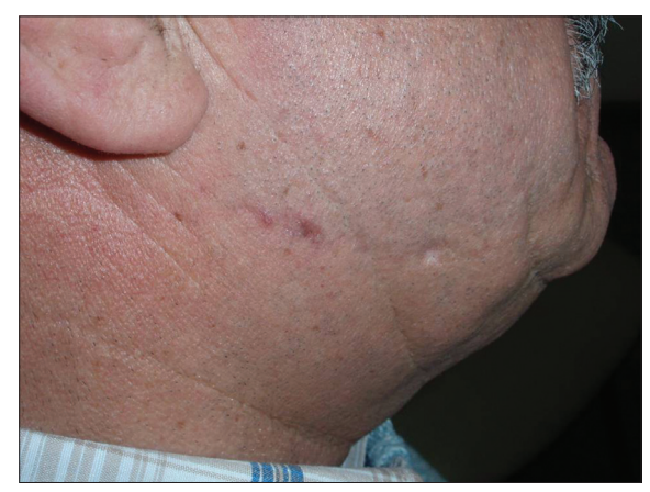
Figure 1b: Complete resolution of the lesion after treatment with topical corticosteroids of the first patient in the study

antibodies (ANAs) were absent. Histological examination revealed orthokeratotic hyperkeratosis with keratotic plaques and liquefaction degeneration of the dermo-epidermal junction. Dense mononuclear infiltrates around perivascular and periadnexal areas were seen in the dermis [Figure 2a]. Mucin could also be observed in the dermis with colloidal iron stain [Figure 2b]. Topical mometasone 0.1% cream was recommended twice daily which resulted in complete resolution of the lesion after two months [Figure 1b].