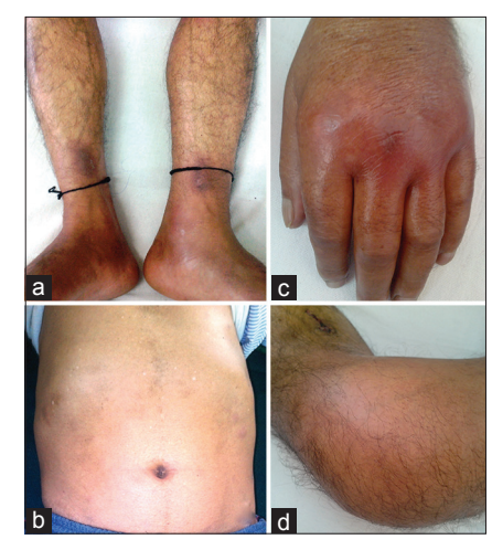
Figure 1: Multiple tender subcutaneous nodules over the lower legs and abdomen (a and b) and swelling of the joints of hand and knee (c and d)

triad of pancreatitis, panniculitis and polyarthritis is known as pancreatitis, panniculitis and polyarthritis (PPP)-syndrome. [2] It is a rare syndrome with high morbidity and mortality so a high index of suspicion is required to diagnose it and initiate timely and appropriate treatment.