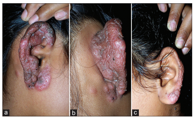
Figure 1: Erythematous scaly papules and plaque on the right ear (a and b) and on the left ear (c)

A 9-year-old girl from a rural area presented with asymptomatic erythematous plagues on both ears and surrounding area for 8 months. The lesion first appeared as small erythematous plaque over the right ear, following ear piercing carried out by a neighborhood barber. The lesions slowly progressed in size to present status. New lesions kept appearing in the vicinity of pre-existing lesion and gradually merged with later. There were no features suggestive of middle/inner ear involvement. On examination, well-defined erythematous scaly papules and plagues were noted on both ears, with the right ear affected more severely. There was the extension of lesion from ear to surrounding areas and few satellite lesions could be appreciated [Figure 1]. There was no cervical or occipital lymphadenopathy and the rest of the mucocutaneous and systemic examination was unremarkable. Peripheral nerve trunk examination did not reveal any thickened nerve trunk. Slit skin smear from lesion was carried out, but no acid-fast bacilli were found on Ziehl-Neelsen staining. Mantoux test with 5-TU showed an induration, sized 12 mm. The punch biopsy from the plaque showed well-formed tubercular granuloma with langhans type of giant cells [Figure 2]. Routine blood investigations and chest X-ray did not reveal any abnormality. Considering clinical presentation and histopathological findings, diagnosis of lupus vulgaris was made. She was