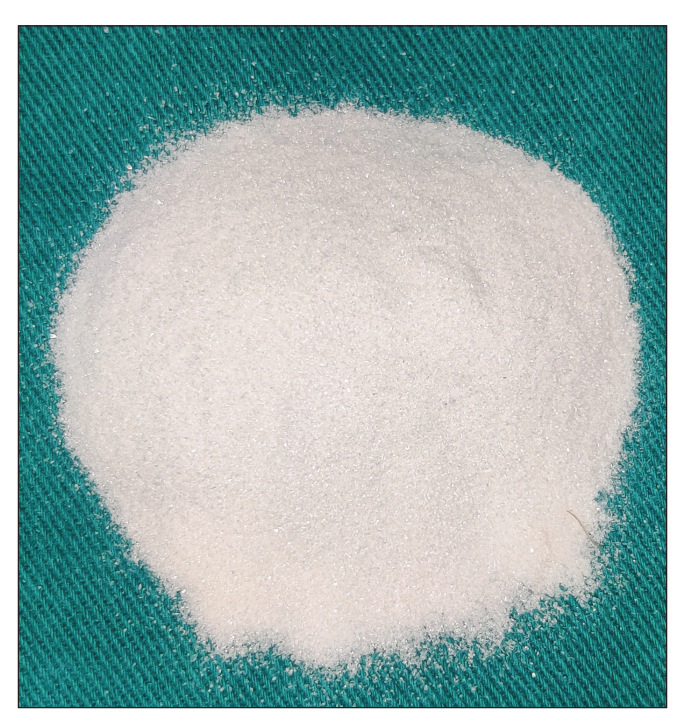
Figure 3: Aluminium oxide crystals used in microdermabrasion.