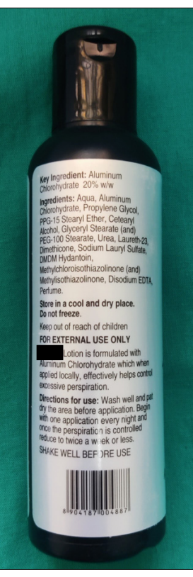
Figure 2: Prescription-based antiperspirant (20% aluminium chlorohydrate).

Aluminium chloride (AlCl_3) (20–40%) in isopropyl alcohol, ether or glycerol works as an effective chemical haemostatic agent, especially in minor dermatological procedures