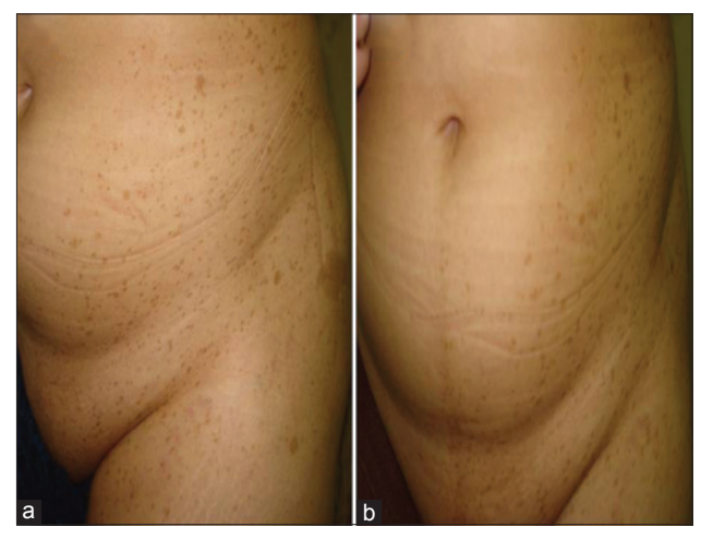
Figure 2: (a) Multiple small, discrete, lightly pigmented macules together with four café-au-lait macules scattered over the left groin extending to the lower abdomen, buttock and upper thigh; (b) frontal view showing the segmental distribution of the pigmented macules with sharp demarcation at the midline

Agminated lentiginosis is a benign condition that is characterized by multiple lentigines that are grouped