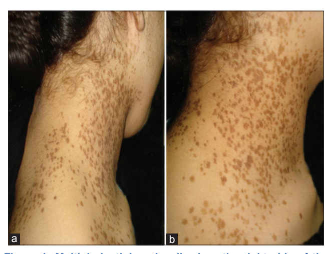
Figure 1: Multiple lentigines localized on the right side of the neck and extending to the right shoulder (note the dermatomal distribution as shown in 1a)

A 22-year-old woman was referred for evaluation of asymptomatic hyperpigmented spots on her lower abdomen that were present since birth and were progressively increasing in number and size with age. Examination revealed numerous pin-point light brown macules unilaterally distributed on the left groin and buttock extending upward to the lower abdomen and downward to the upper thigh. Four café-au-lait macules ranging in diameter from 1 to 4 cm were seen among brown spots. No neurofibromas could be detected [Figure 2].