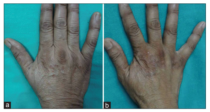
Figure 4: (a) Multiple papules on dorsum of hand (b) Resolution of lesions with few lesions healing with atrophy

In this study, all the patients had complete clearance of lesions with a maximum of eight pulses of monthly ROM with no recurrence in the follow-up period. None of the drugs that the patients were taking for diabetes mellitus, hypertension, hypothyroidism, rheumatoid arthritis, or osteoarthritis was known to cause granuloma annulare.