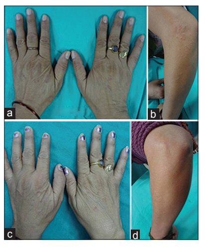
Figure 5: (a) Annular plaques present on dorsum of both hands (b) Erythematous papules and serpiginous plaques on forearm and arm (c) Resolution of lesions on dorsum of hands after 6 monthly pulses of ROM (d) Resolution of lesions after 6 monthly pulses of ROM

The association of granuloma annulare with several comorbid conditions like Type 1<sup>[9]</sup> and Type 2 diabetes mellitus, thyroid disease, malignancy, and dyslipidemias<sup>[10]</sup> has been observed. In our study also, all our patients had associated co-morbidities with three having more than one.