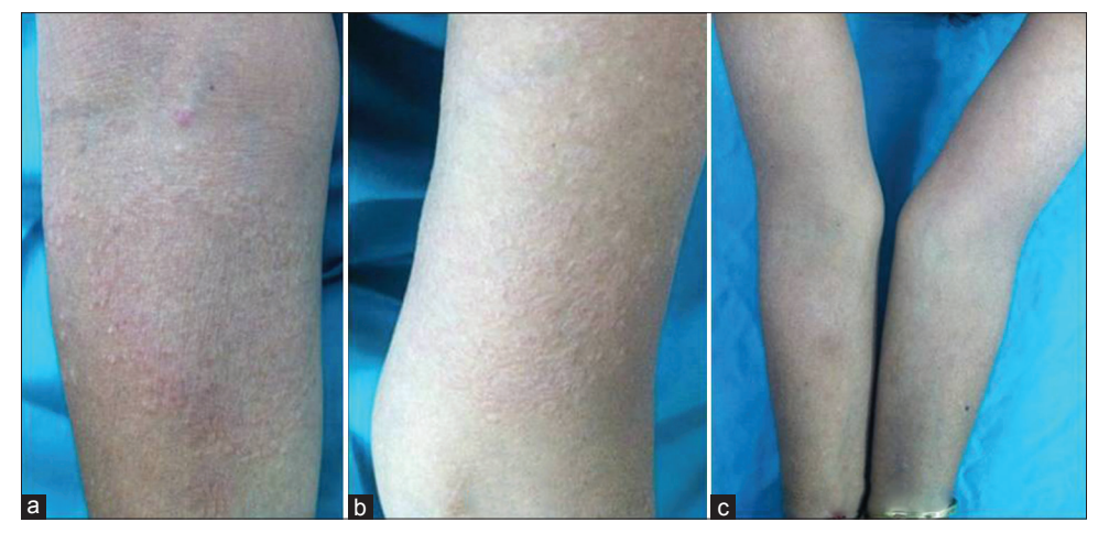
Figure 3: (a) Multiple skin colored to erythematous papules coalescing to form an annular plaque on forearm (b) Multiple skin colored papules and plaques on arm (c) Resolution of lesions on forearm and arm