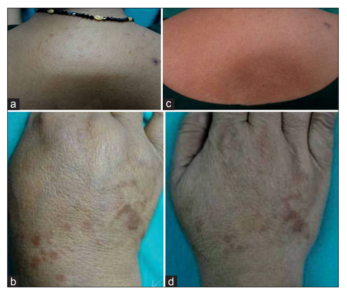
Figure 1: (a) Discrete papular lesions of GGA involving the upper back (b) Hyperpigmented papules, plaques, and serpiginous lesions present on the dorsum of right hand (c) Complete resolution of lesions involving the upper back (d) Resolution of lesion on hand with PIH and atrophy

Rifampicin has antimicrobial activity, and can influence antibody formation and cellular immune response, specifically delayed-type hypersensitivity.<sup>[6]</sup> Ofloxacin interferes with protein synthesis, inflammation,