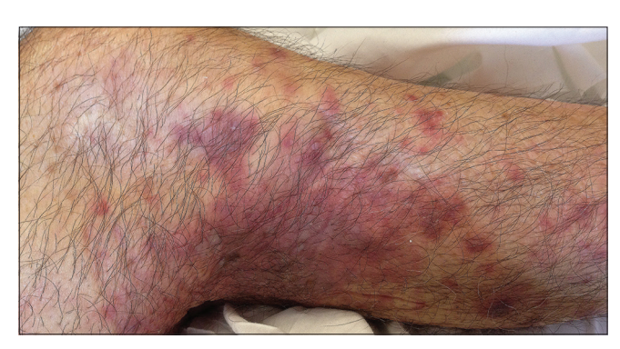
Figure 1: Pink to red, indurated, shiny papules coalescing into plaques on the right leg and thigh on initial presentation

The differential diagnosis of this presentation includes erysipelas, cellulitis, radiation dermatitis and deep vein thrombosis.<sup>5</sup> To