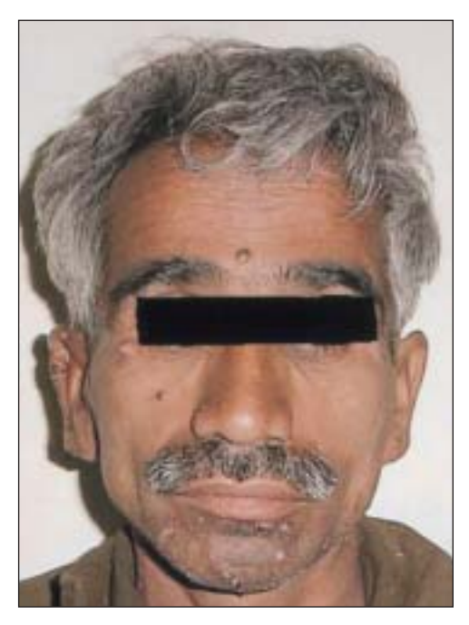
Figure 1: Papulonodular lesions on the face