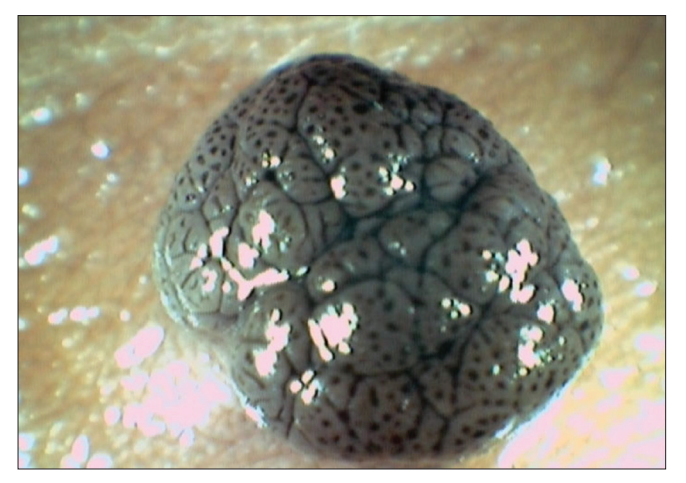
Figure 6: Comedo-like openings, fissures, and ridges on pedunculated seborrheic keratosis

60 years.<sup>[6]</sup> In our study, 250 patients are with SK. The most common age group affected by SK was 60 years and above (100 cases, 40%), followed by 51–60 years (64 cases, 25.5%), 41–50 years (45 cases, 17.9%), 31–40 years (29 cases, 11.6%) and less than 30 years (12 cases, 4.8%) showing a clear correlation of SK with age as mentioned in the literature.