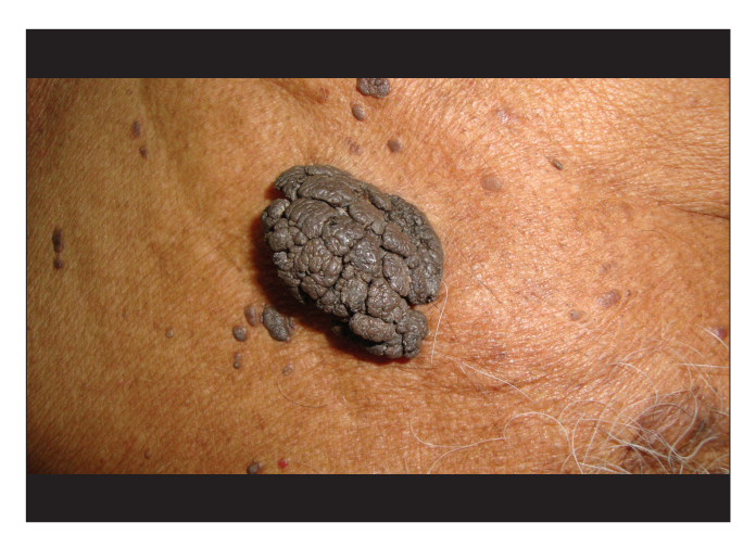
Figure 1: Common seborrheic keratoses on the chest

The most common clinical variant was common seborrheic keratoses (CSK) (150 cases, 60%) [Figures 1 and 2] followed by dermatosis papulosa nigra (DPN) (116 cases, 46.4%) [Figure 3], pedunculated SK