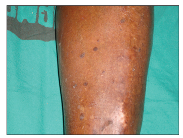
Figure 4: Stucco keratosis on the leg