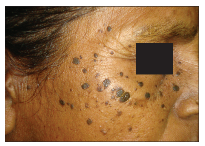
Figure 2: Common seborrheic keratoses on the face