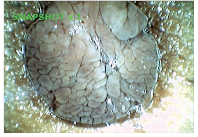
Figure 7: Cerebriform appearance with mainly fissures and ridges on pedunculated seborrheic keratosis

Common SK appear only on hair-bearing surfaces, predominantly on the head, trunk, and neck. They commonly present as sharply demarcated, brown, "stuck on" papules with velvety or granular surfaces, they are uniformly tan to dark brown but may range from white to black.<sup>[7]</sup> In our study, 60% (150) of cases had CSK, the commonest of all variants that we had observed. The existing literature mentions that CSK