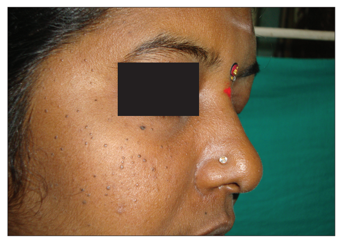
Figure 3: Dermatosis papulosa nigra on the cheeks