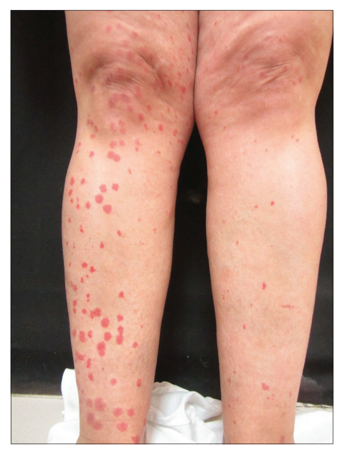
Figure 3: Erythematous-purpuric macules in both legs limited to the exposed area to diode laser. Fewer lesions in the left leg due to decrease in intensity

collected 36 patients with a similar clinical presentation, but of delayed onset, most of whom presented with lesions in the first session itself. Biopsy in three cases was consistent with the diagnosis of urticaria. Landa points out that the etiology may be related to an antigen in the hair shaft or follicle itself, which is supported by the fact that, as the amount of antigen