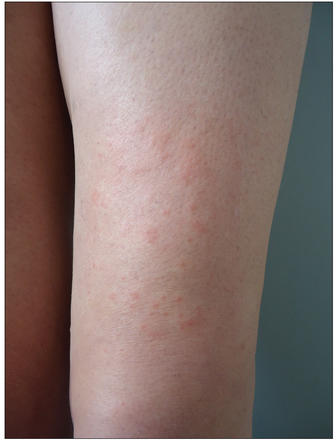
Figure 1: Erythematous papules that converge to form erythematousedematous plaques limited to the exposed area to Alexandrite laser

Subsequently, the patient was exposed to alexandrite laser in a small area in the anterior thigh, and after one hour she developed erythematous, edematous plaques limited to the exposed area [Figure1]. Given the background, a polymorphous light eruption induced by laser was suspected and a punch biopsy was obtained, revealing a perivascular infiltrate - predominantly lymphocytic and a bluish interstitial and perifollicular deposit that stained with colloidal iron, corresponding to mucin [Figure 2]. Immunofluorescence was negative. The diagnosis of alexandrite laser-induced localized primary cutaneous mucinosis was made and laser was not performed again. We hypothesize that the reason for the