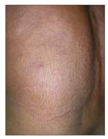
Figure 2: Similar lesions as seen on the lateral view of the trunk

A skin biopsy was taken from the elevated edge of one of the larger lesions on the lower back to confirm the diagnosis. Histopathology showed a characteristic zonal histology. The center showed destruction of dermal elastic tissue, with mild fibrosis. In the raised active edge of the lesion, there was a granulomatous reaction, which includes histiocytes, multinucleated giant cells and lymphocytes. Elastic fibers were greatly reduced with elastoclasia; most of those that remained were fragmented. Areas of necrobiosis surrounded by palisaded rim of histiocytes in the mid and upper dermis were seen in the annular rim. No acid-fast