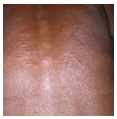
Figure 1: Multiple annular lesions with an elevated papular serpiginous border over the lower back

Kumari, et al. Granuloma multiforme in India