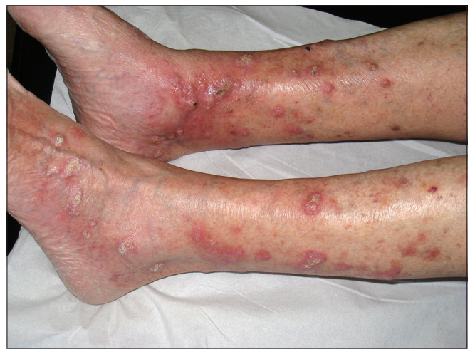
Figure 1: Erythematous scaly plaques and multiple verrucous, dome-shaped nodules