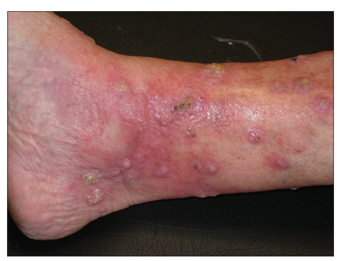
Figure 2: Keratoacanthoma-like papules and nodules on sun-damaged skin of the leg