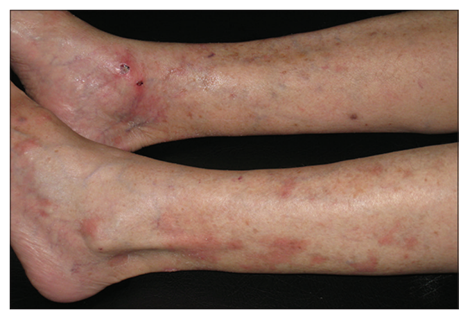
Figure 4: Significant improvement after 3 months of acitretin treatment