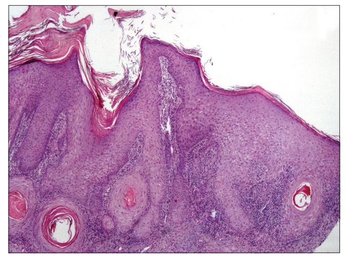
Figure 3a: Hyperkeratosis, irregular epidermal hyperplasia and dermal lymphocytic inflammation (H and E, \times\,200)