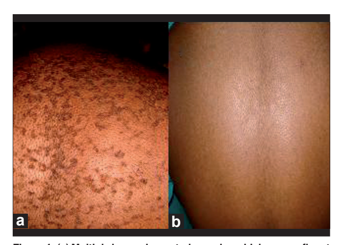
Figure 1: (a) Multiple hyperpigmented macules which are confluent in the center and reticulate at the periphery involving the upper back. (b) Complete resolution of lesions over the back with minocycline

A 25-year-old female presented with asymptomatic pigmented lesions over the back of one year duration. Except for anemia and obesity, her general and systemic examination did not reveal any findings. Dermatological examination revealed hyperpigmented scaly macular lesions which are confluent in the center and reticulate at the periphery in the interscapular area [Figure 2a]. 10% KOH wet mount test from scrapings showed fungal hyphae. Skin biopsy revealed epidermal hyperplasia with lamellated ortho hyperkeratosis