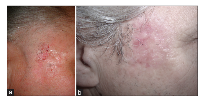
Figure 2: (a) A deep, infiltrating plaque localized over the forehead. (b) Post-electrochemotherapy, at one year follow up, with mild scarring and hyperpigmentation

patients with poor general condition or co-morbidities. In conclusion, this technique appears to be well tolerated, safe and repeatable. In our case, this approach gave very satisfying results with no recurrence and a good aesthetic outcome at follow up one year later. Our experience, along with that of others, demonstrates that electrochemotherapy with intravenous or intra-tumour bleomycin is an effective treatment option for patients with advanced basal cell carcinoma.