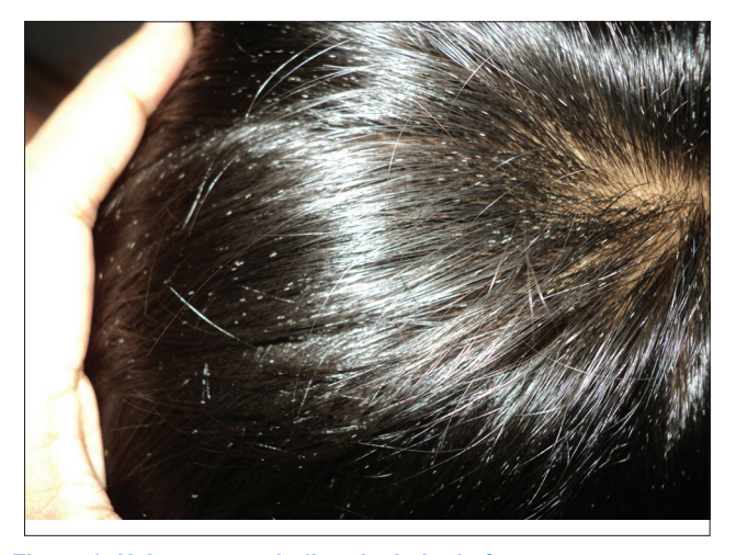
Figure 1: Hair casts encircling the hair shafts

Hair casts are described as fine white amorphous keratinous cylindrical structures of variable sizes