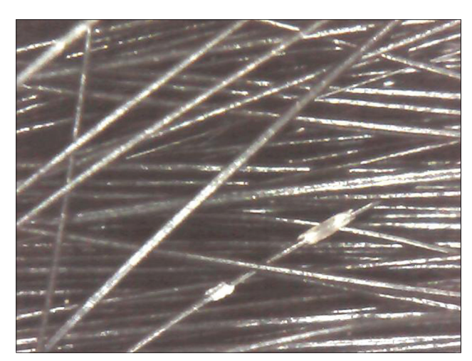
Figure 2: Dermoscopic appearance of the hair casts: whitish coloured elongated tubular structures were seen encircling the hair shafts

and number that encircle the hair shaft at varying intervals from the scalp surface.[1] It is hypothesized to be due to extension of the root sheath covering beyond the limits of the hair follicle.[2] Hair casts, also known as pseudonits, can be moved freely along the length of the hair shaft. This feature helps to differentiate it from conditions such as nits of pediculosis capitis, piedra, trichomycosis and trichorrhexis nodosa.[1,3-5] In addition, hair microscopy is diagnostic for nits and trichorrhexis nodosa. A negative KOH examination and fungal culture ruled out piedra. Hair casts are made of keratin, therefore they dissolve in KOH preparation after some time. This is an idiopathic condition, although associations with psoriasis, seborrheic dermatitis, lichen simplex, lichen spinulosus, braiding and following use of hair lacquer/hair spray have been described.[2,3] Propionibacterium acnes has been proposed as a causative agent of hair casts.[4] Solutions containing keratolytic agents such as salicylic acid and retinoic acid have given good results.[5] Hair casts are rarely reported, but form an important differential diagnosis for more common conditions. Dermoscopic appearance and gradual disappearance of the hair cast in KOH preparation can be an important clue for the diagnosis of this rare condition.