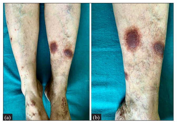
Figures 1a & 1b: Two prominent plaques showing a classic reddish-brown appearance surrounded by a yellowish-golden rim. Note the signs of venous flares surrounding these plaques.

Based on the clinical, dermatoscopic and histopathological findings, a diagnosis of multiple lichen aureus was made. Midpotency topical steroid, once daily application, in combination with oral vitamin C supplementation and avoidance of prolonged standing, were suggested for treatment. The acute appearance of characteristic, rust-yellow or gold-coloured papules or circumscribed patches and plaques characterises lichen aureus. The name "lichen aureus" draws attention to the eruption's traditional gold-brown hue. Notably, lesions that are copper-orange or violaceous may also be seen in