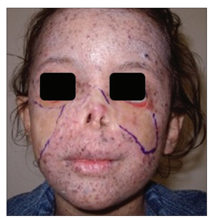
Figure 3a: Frontal postoperative image of 3 months