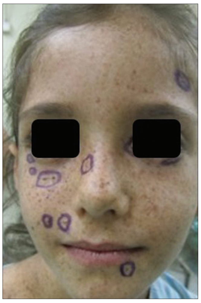
Figure 6a: Preoperative photo showing several lesions in the face