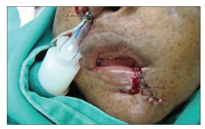
Figure 7f: Intraoperative patient after resection of the lesions, lower face close-up