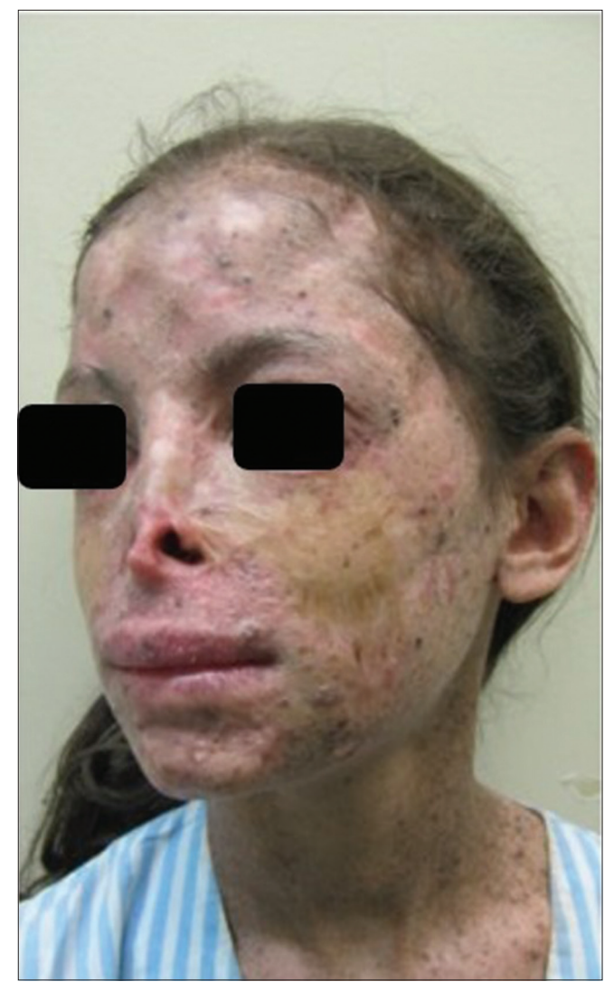
Figure 5c: Patient at the postoperative period of 5 months, showing the result of surgeon-assisted healing in left profile view

Xeroderma pigmentosum is an autosomal recessive disorder in which patients exhibit impaired DNA repair. 12,18 Skin lesions are caused by the effect of ultraviolet light on cellular genetic material, causing uncontrolled mutations and proliferation due to the heterogeneity of defects in cell repair mechanisms. This multiplicity is evidenced by the wide variety of genetic variation associated with xeroderma pigmentosum: XPA, XPB/ERCC3, XPC, XPD/ERCC2, XPE/DDB2, XPF/ ERCC4, XPG/ERCC5 and XPV/POLH.6,12 Patients are therefore classified according to the type of genetic mutation they carry (XPA or XPB, for example). Patients in the XPA to XPG groups have defects in nucleotide excision repair.<sup>6,12</sup> Patients with the XPV mutation have normal nucleotide excision repair but have a deficiency in allowing DNA replication after DNA damage caused by ultraviolet light. 12, Photosensitivity is thus a cardinal characteristic of this genodermatosis. 12,18,25