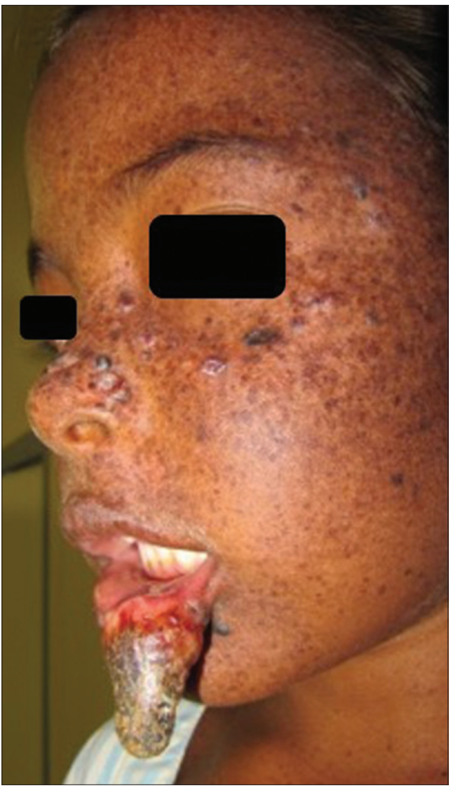
Figure 7c: Patient preoperatively showing lesions on the back and wings of the nose, on the left malar region and on the lower lip in left profile view