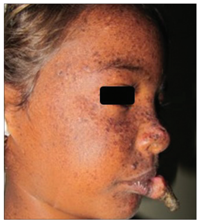
Figure 7b: Patient preoperatively showing lesions on the back and wings of the nose, on the left malar region and on the lower lip in right profile view

For the cutaneous lesions that originate from the failure of DNA repair, there are several studies with a multiplicity of