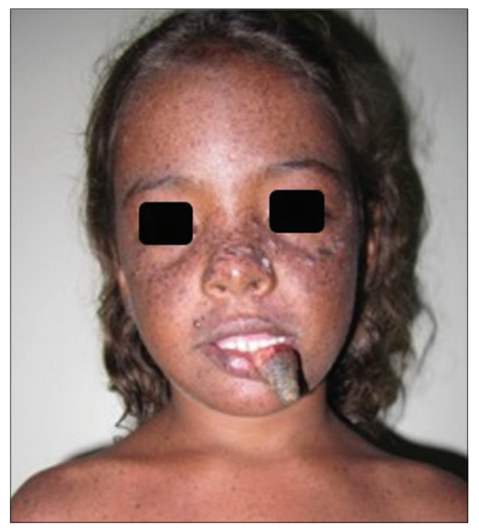
Figure 7a: Patient preoperatively showing lesions on the back and wings of the nose, on the left malar region and on the lower lip in frontal plane

This scientific scenario could be explained by the rarity of xeroderma pigmentosum, making it difficult to perform large randomized clinical trials and meta-analyses. Thus, the long-term follow-up of patients with ongoing surgical treatment, and documenting the evolution of the postoperative period should be encouraged.