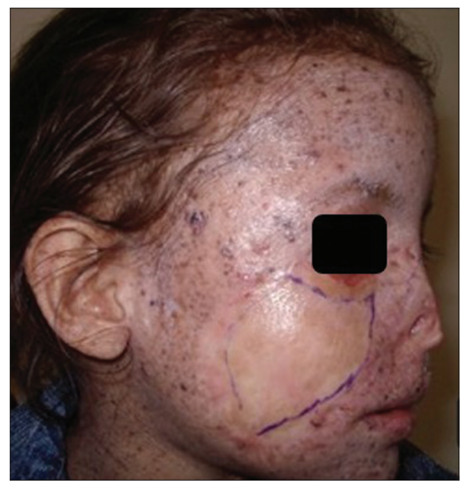
Figure 3b: Right profile postoperative of 3 months

Outpatient Clinic of the Professor Alberto Antunes University Hospital (UFAL HUPAA), Federal University of Alagoas, where a diagnosis of xeroderma pigmentosum was made. On the same date, instructions for continuous solar photoprotection were emphatically given but not followed by the parents or relatives. Almost 3 years after diagnosis, in October 2006, at 4 years of age, the patient underwent incisional biopsy and subsequently, regular excision of