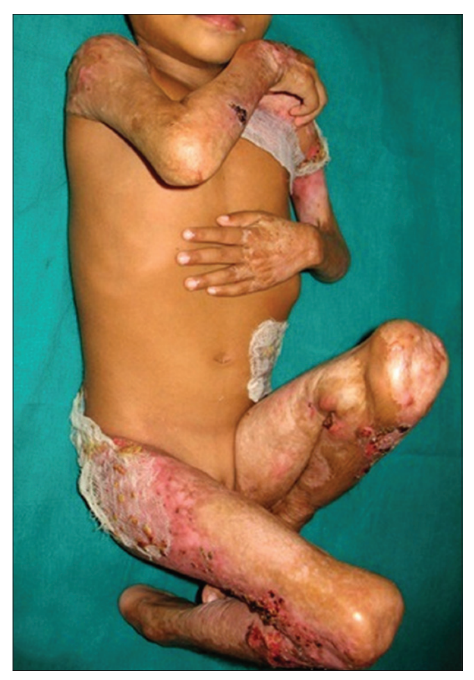
Figure 3a: 3-year-old child with generalized pyoderma gangrenosum