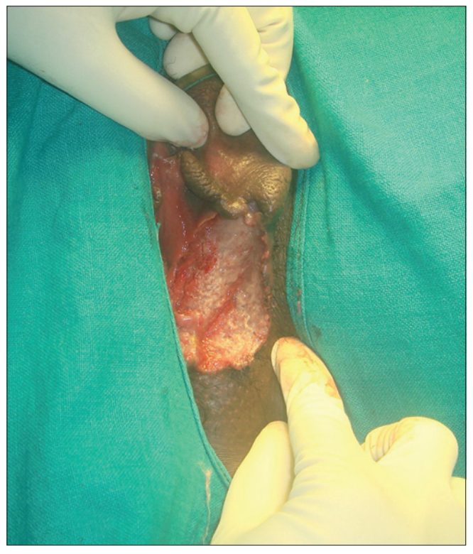
Figure 1c: Pyoderma gangrenosum of the vulva

19, dapsone in 2, minocycline in 3, salazopyrin in 9 and azathioprine in 3 patients). Patients were tapered off steroids in 4–8 months whereas the steroid-sparing agents were continued for another 3–4 months.