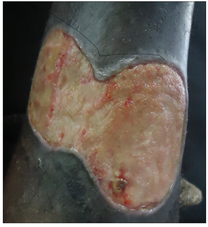
Figure 1a: Pyoderma gangrenosum affecting the leg

*Numbers in brackets indicate the number of patients, 'One male patient had coexistent pyoderma gangrenosum, diabetes mellitus, selective immunoglobulin E deficiency, idiopathic hypereosinophilic syndrome and lymphocytic colitis. Other systemic diseases noted in the study subjects were systemic lupus erythematosus (female patient), mononeuritis multiplex and Klinefelter's syndrome. IBD: Inflammatory bowel disease, DM: Diabetes mellitus