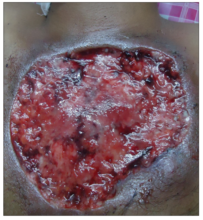
Figure 1b: Pyoderma gangrenosum affecting the chest wall

Depending on the treatment needed, there were 11 (18%) mild, 39 (63.9%) moderate and 11 (18%) severe cases of pyoderma gangrenosum [Table 1]. None of our patients responded to potent topical or intralesional steroids alone. Nine (81.8%) of the