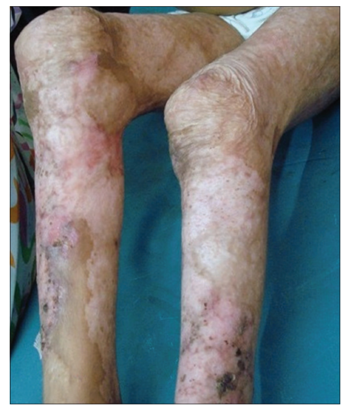
Figure 3b: The same child with healed lesions following treatment with intravenous immunoglobulin G

in our study.<sup>[5-7]</sup> The absence of pustular pyoderma gangrenosum in our study population was surprising since the common underlying systemic disease in our subjects was inflammatory bowel disease. The clinical types and sites of involvement documented by us