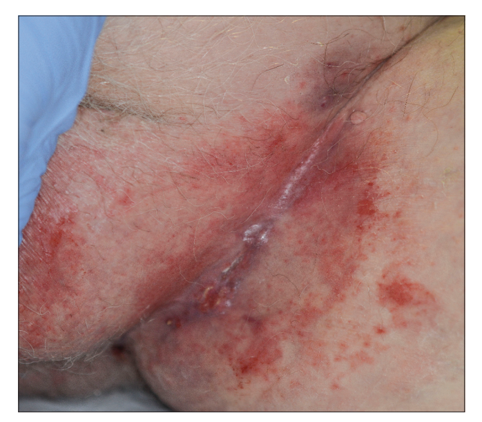
Figure 3: One month after surgery, the area was healing well. Significant erythema, scale, and satellite pink macules again in a kissing distribution in the left inguinal fold were noted

unclear. Betti et al. evaluated 3254 consecutive basal cell carcinomas and found head and neck to be the most common site [1766 (54.3%)], followed by trunk [1113 (34.2%)] limbs [362 (11.1%)] and genitalia [13 (11.1%)].<sup>1</sup> Our patient's risk factors included age, prior history of basal cell carcinoma on the face, and possibly chronic skin inflammation due to intertrigo. It has been suggested that local factors like concave shape, reduced skin tension, and skin folds favour the development of basal cell carcinoma in sun-protected areas like axillae and groin (as in our case).<sup>2,3</sup> Heckmann et al. concluded that reduced dermal thickness, altered connective tissue arrangements, altered expression of metalloproteinases, and reduced numbers of integrins at these sites may also contribute to the development of this disorder.<sup>2</sup>