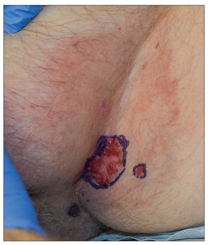
Figure 2: Three basal cell carcinomas outlined with a skin-marking pen in the left inguinal fold. Surrounding erythema and mild scale were noted in a kissing distribution in the inguinal fold

Sun-protected areas of the body rarely develop basal cell carcinoma and its etiology in such anatomic locations is