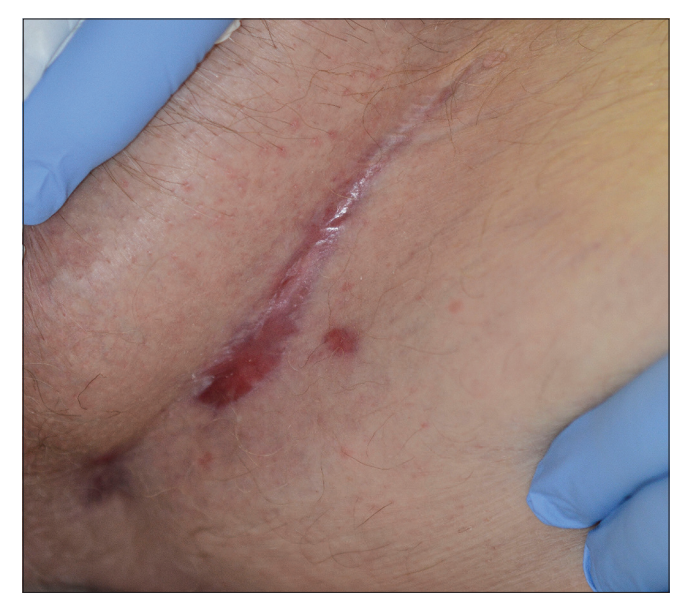
Figure 4: Three months after surgery, the patient's surgical sites were well-healed and his intertrigo had cleared with the use of three times per week ketoconazole shampoo

Nardinocchi et al. demonstrated a high infiltration of IL-17 + and IL-22 + T-cells in basal cell carcinomas.<sup>5</sup> IL-17 and IL-22 also increased proliferation and migration of the basal cell carcinoma cell line M77015 in an in vitro study.<sup>5</sup> Several reports suggest that IL-17 upregulates nuclear factor kappa light chain enhancer of activated B cells' (NF \kappa B) signaling and IL-22 activates the signal transducer and activator of transcription 3 (STAT3) pathway,